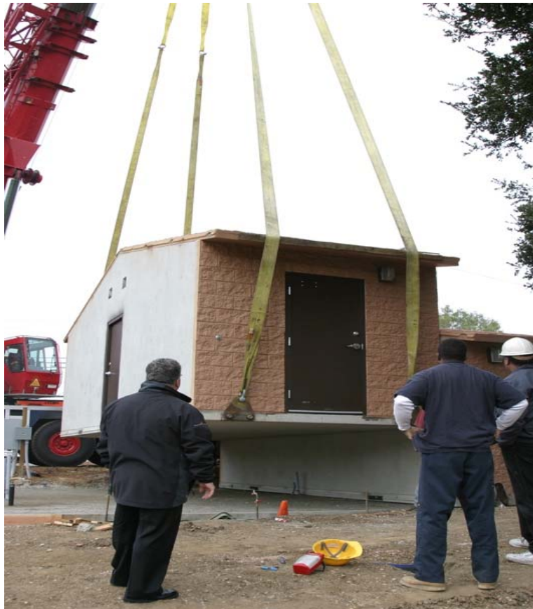
Jack Farrell Park Concessio Building