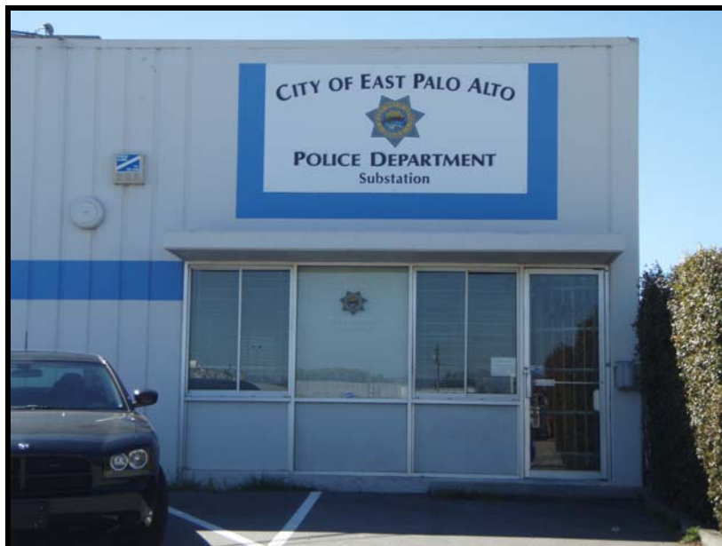
Police Department Parole Re-Entry Substation

The Fiscal Year 2008-2009 Adopted Budget Net General Fund Contribution of $3,940,611 is an increase of $270,803 from the Amended Budget Net General Fund Contribution of $3,669,808. This 7.4% increase reflects an anticipated wage increase and enhanced benefits with members of the Police Officers' Association. The projected budget recommends the funding of the Administrative Services Manager and the restoration of the Crime Analyst from a part-time to full-time position. Additionally, the purchase of two police vehicles is being proposed as the City continues to implement a repair/ replacement policy to replace its rolling stock.