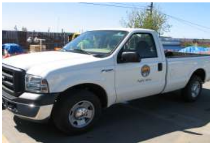
New Public Works- Maintenance truck.