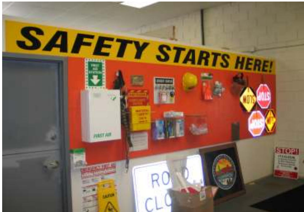
Safety reminders at the Corporation Yard.