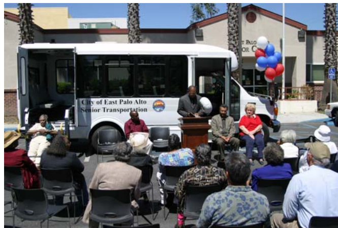
Inauguration Ceremony for new Senior Transportation Van.

The Fiscal Year 2007-2008 Adopted Budget Net General Fund Contribution of $181,765 is an increase of $12,077 from the FY 2006-2007 Amended Budget Net General Fund Contribution of $169,688. This 7.1% increase results from a reduction in Revenue sources -89.7% increasing the General Fund Contribution. The reduction in Revenue is offset on the decrease of expenditures in Purchased Services. The adopted budget also reflects the elimination of a 12 day mandatory furlough program.