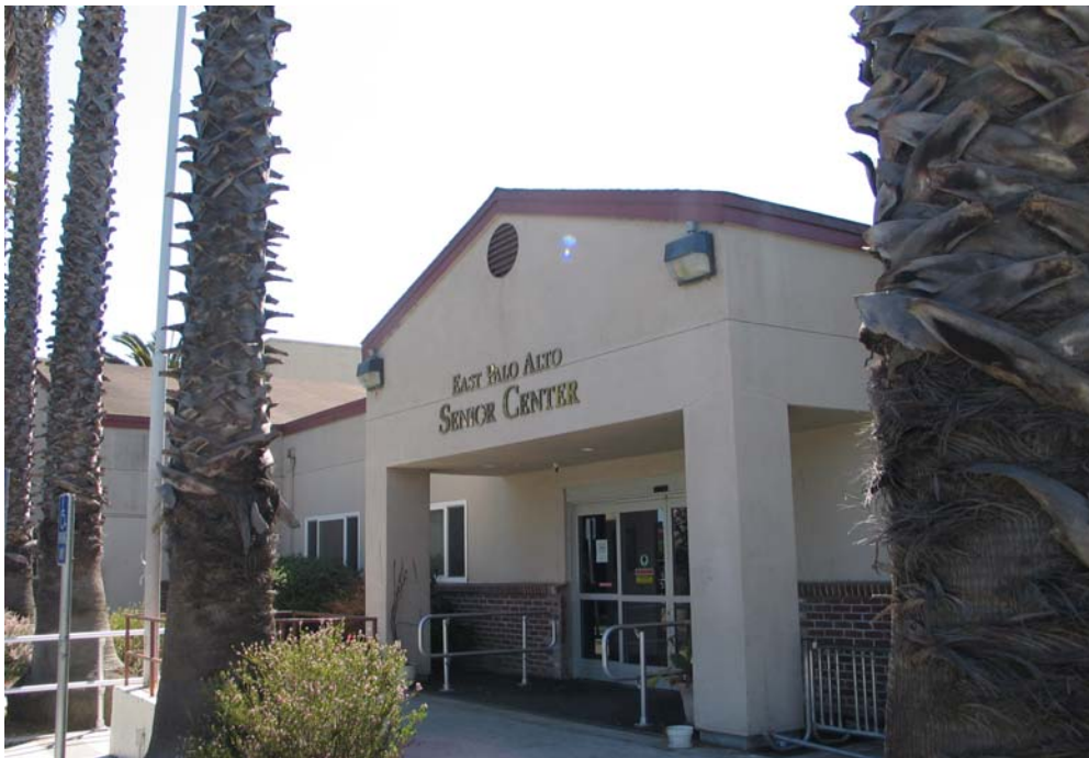
East Palo Alto Senior Center